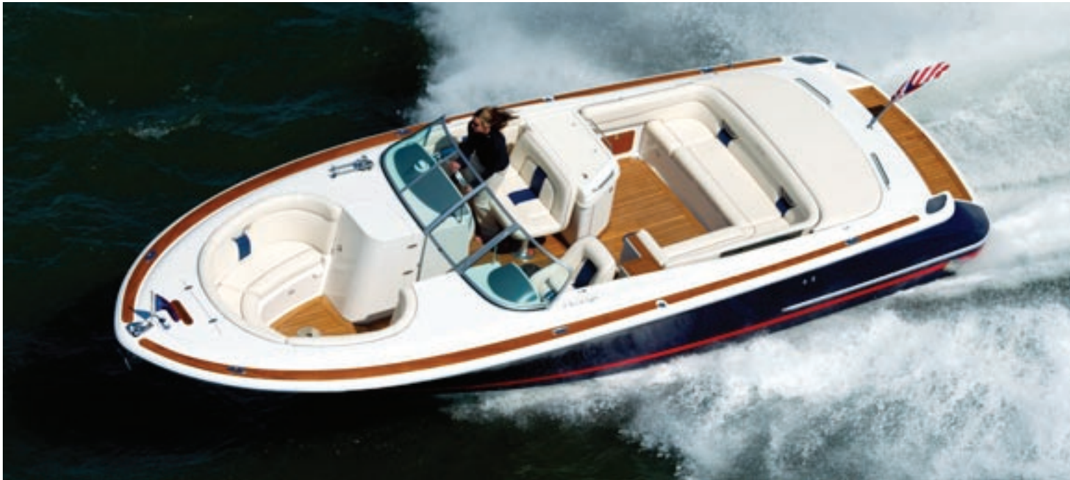
The forward and aft seating can easily be converted into sunpads in just a few simple steps.